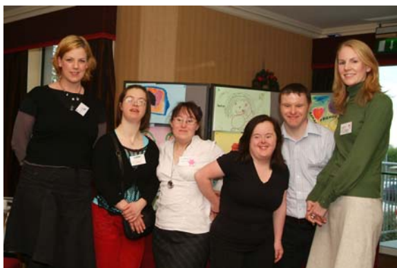
Friendship & Romance Conference Presenters